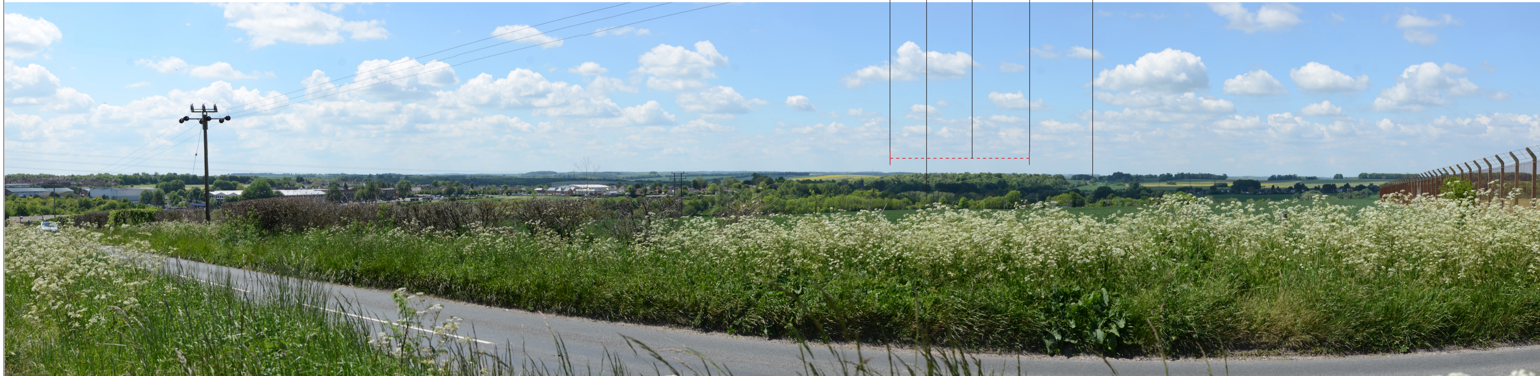
PROPOSED (SUMMER YEAR 15)